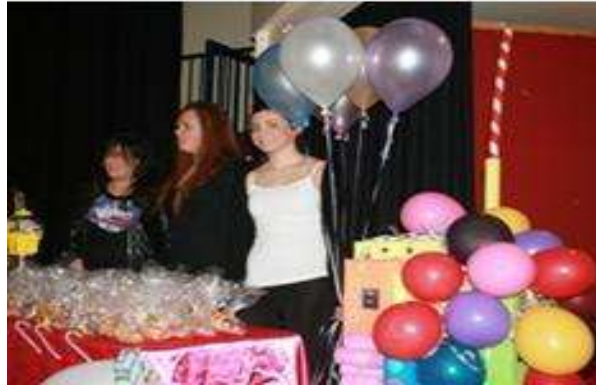
Just one of the games the girls had organised