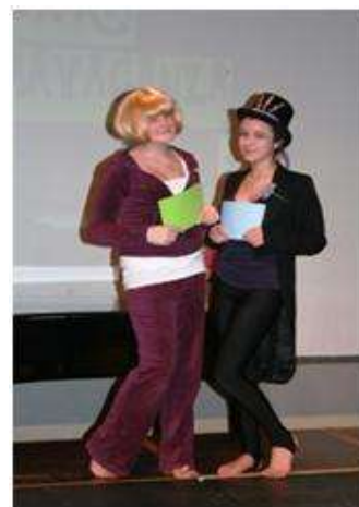
MCs Violet Beauregard and Willy Wonka

The culmination of months of hard work for Upper IV came to a successful conclusion on Friday 26 February in their pupil organised, charity fundraising event Willy Wonka's Family Extravaganza on the theme of Roald Dahl's Charlie and the Chocolate Factory.