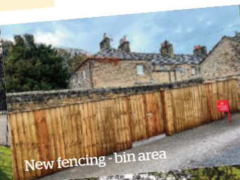
New fencing - bin area