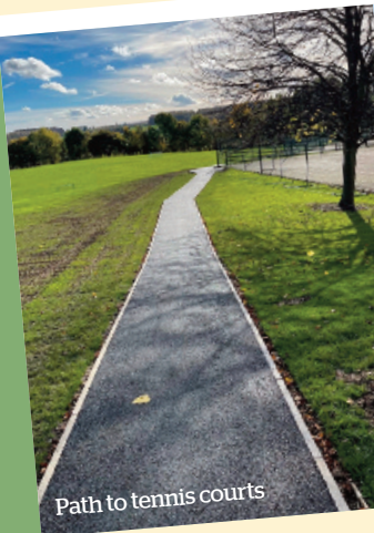
Path to tennis courts

Some of the key changes made during the summer and over the past few months have included: the installation of a new visual intercom system, a new rope fence around the car park and in front of the main school grassed area, new pathways to hard standing areas, a new fenced bin storage area near the kitchen and a new temporary 'ecodeck' car park on the field to ease the pressure on car parking during drop off and pick up times.