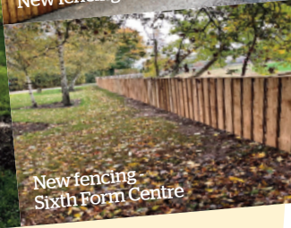
New fencing - Sixth Form Centre