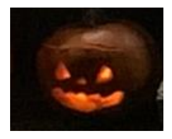
2<sup>nd</sup> Place - Elle (Harewood)

3<sup>rd</sup> Place - Sophie (Beningbrough) and Tilly (Harewood) - joint effort.