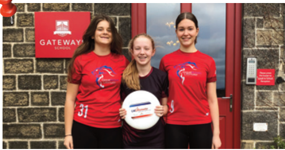
The outstanding players selected to represent Great Britain this year