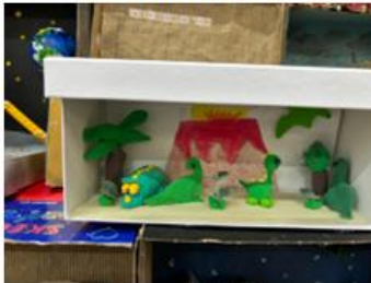
Poppy (L2G) Land of the Dinosaurs