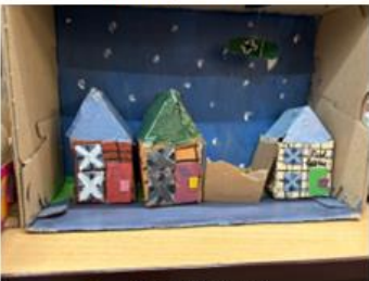
Sophia (L3AH) The Blitz