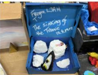
Freya (L3AH) The Sinking of the Titanic