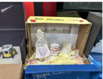
Elina (L2G) The Gunpowder Plot