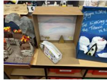
Toby (U1A) Ancient Egypt