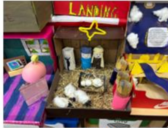
Poppy (U2A) The Nativity