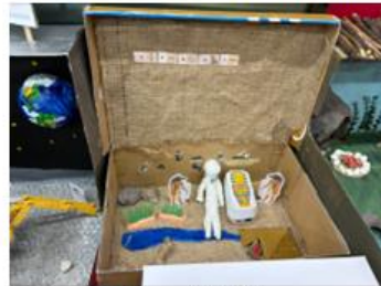
Ethan (U1A) Ancient Egypt