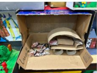
Larisa (L2K) The Oregon Trail