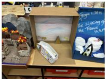
Ruby (L2K) Ancient Egypt