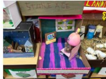
Tilly (TRB) The First Colour Television