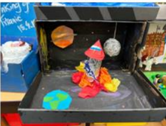
Ethie (TRH) The First Dog in Space