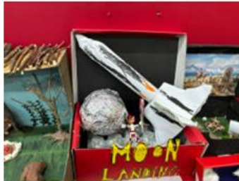
Nihal (L2G) The Moon Landing