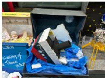
Alice (L1J) The Sinking of the Titanic