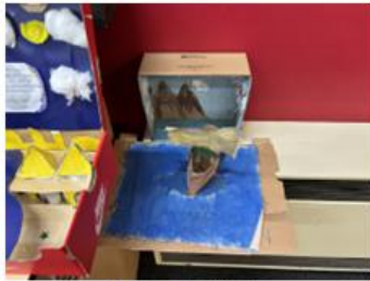
Albie (U2A) Viking Raiders