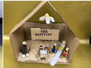
Isabella & Willow—L3W